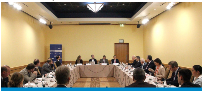
Special meeting of International Election Working Group

<u>Police dog units</u> received specialized vehicles and equipment, as part of our project against small arms and light weapons. On 3 December, representatives from the OSCE Presence, Ministry of Interior, State Police and donors attended a ceremony marking the conclusion of the training sessions for the Canine Training Institute of the Albanian State Police. Plans to upgrade the Institute's premises were also discussed. The project is funded by the European Union, Germany and France.