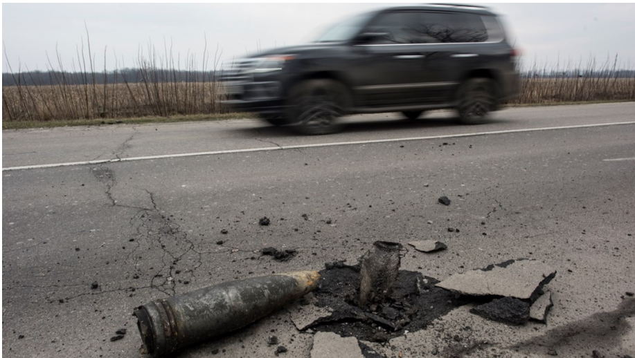
Unexploded ordnance in eastern Ukraine