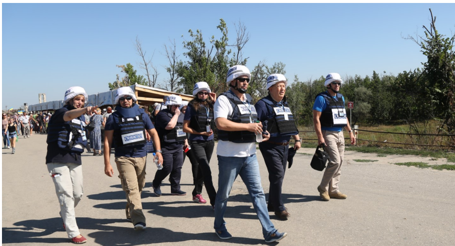
OSCE SMM Chief Monitor with other SMM monitors at the entry-exit crossing point in Stanytsia Luhanska, Luhansk region, 29 August 2016.