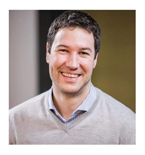
Independent Consultant on good governance, public sector integrity and anti-corruption, Netherlands