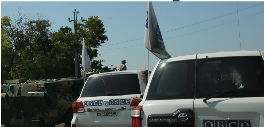
OSCE SMM has once again been denied access to Novoazovsk (40km east of Mariupol) by the so-called "DPR", 22 July 2017.