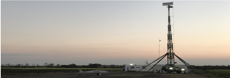
SMM long-range UAV base in Stepanivka (OSCE)