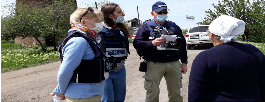
Monitoring officers speaking to a civilian in Starohnativka, Donetsk region