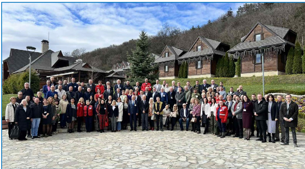
District simulation exercise of the Sector for Emergency Management of the Ministry of the Interior of Serbia, Vrdnik, March 2024

headquarters, communal services, and the Red Cross, participate in district simulation exercises. Participants go through a real-life scenario and work out each step in defending against natural disasters and accidents.