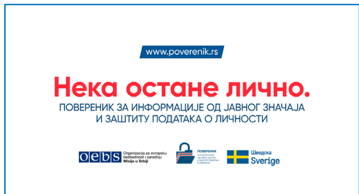
Keep it Personal – the motto of the public campaign dedicated to personal data protection

The main message of the campaign was that personal data such as name, social security number, e-mail address, bank account number, health data, etc., should not be disclosed to others but should be treated as valuable personal property.