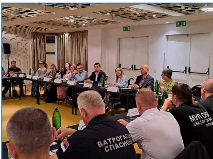
Conference „Persons with disabilities in emergencies”, Belgrade, June 2024

To educate citizens on how to protect themselves from natural disasters and accidents, the Mission, in cooperation with the Sector for Emergency Management, published the