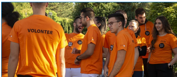
Training for young volunteers in emergencies organized by the OPENS Youth Association, Ečka, October 2022

Through the project, the Mission also supported numerous researches concerning the security risks to which young people are exposed. One of the more extensive researches was conducted in 2023, when the Association Rainbow from Šabac inquired into causes of peer violence in schools in Serbia on a sample of 1,400 high school students, parents, and teachers, based on which recommendations were offered to strengthen security in schools.