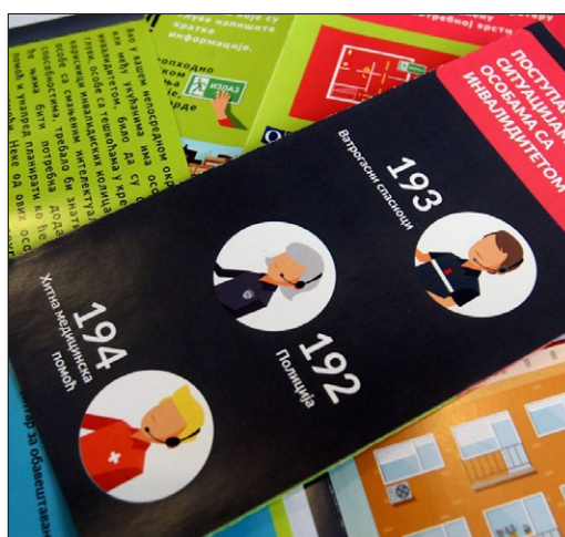
Detail of the brochure for support for people with disabilities during emergencies