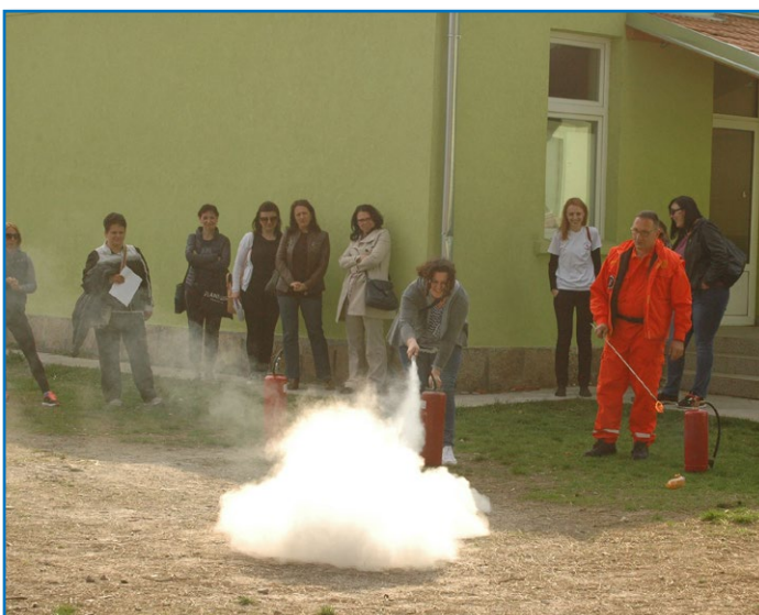
Fire drill, a segment of the workshop „Participation of women in disaster risk reduction”, organized by the Fenomena Association, Kraljevo, March 2019

The Mission also supported the organization of seminars