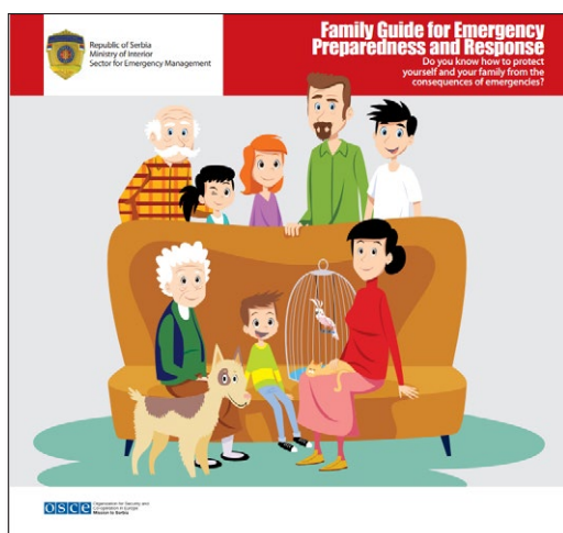
Cover of the publication „Family Guide for Emergency Preparedness and Response” printed in cooperation between the Sector for Emergency Management of the Ministry of the Interior of Serbia and the OSCE Mission to Serbia

Special attention is paid to improving the protection of persons with disabilities during natural disasters and accidents. In cooperation with NOOIS, several conferences were held addressing the issues of persons with disabilities and their protection during disasters. At the meeting held in June 2024 in Belgrade, representatives of numerous associations of persons with disabilities from the entire country drafted recommendations for improving the position of persons with disabilities during emergencies.