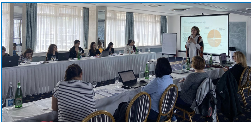
Working meeting of civil society organizations regarding development of recommendations for the third National Action Plan (NAP) for the implementation of UN Security Council Resolution 1325 „Women, Peace and Security”, Šabac, April 2023

The UN Security Council Resolution 1325 is the most significant global document dedicated to the gender dimension of security and devoted to strengthening women's security in times of conflict and crisis. In the previous decade, the Mission helped develop both National Action