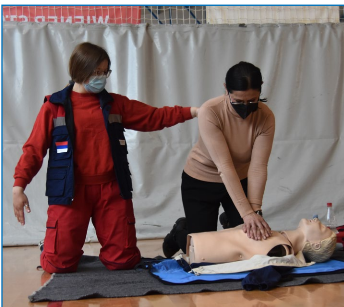
First aid training for high school students from Kraljevo, organized by the Fenomena Association, 2021