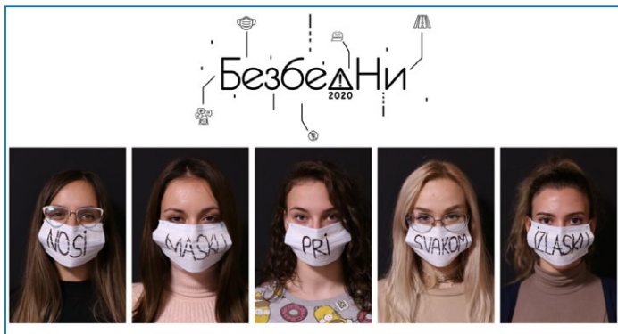
Campaign dedicated to youth safety organized by Club for Youth Empowerment 018 (KOM018) from Niš, 2020

Agenda, as well as for the development of recommendations for the work of local communities with the aim that topics important for the improvement of youth security are included in Local Action Plans (LAPs).