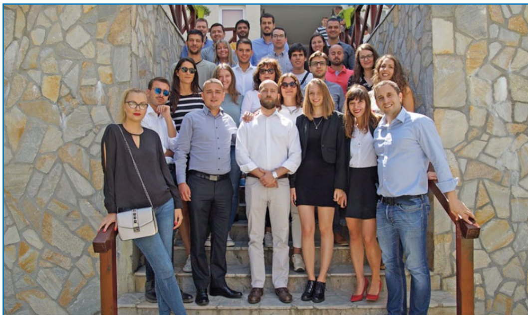
Participants of the Summer School dedicated to security topics held with the support of the OSCE Mission to Serbia and the Government of Sweden, Kopaonik, August 2019

With the support of the Mission, an alumni network was formed in 2015, which today gathers more than one hundred and twenty young experts, former scholarship recipients, who are now in prominent positions in security sector institutions and state administration, as well as in civil society organizations, in businesses and academic institutions. The work of this network is of great importance not only for the professional careers of the alumni but also for the entire process of reforms and democratization of the security sector in Serbia.