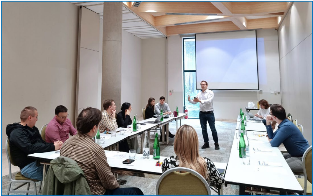
Seminar „Academic writing” for students of master's and doctoral studies in security, organized by the Faculty of Political Sciences, Zlatibor, May 2024

Through the project Consolidating the Democratization Process in the Security Sector in Serbia , financed by the Government of Sweden, the OSCE Mission awards up to fifteen scholarships each year for master's and doctoral studies in the field of security at the Faculty of Political Sciences (FPN) and the Faculty of Security Studies. Since 2010, 181 scholarships have been awarded.