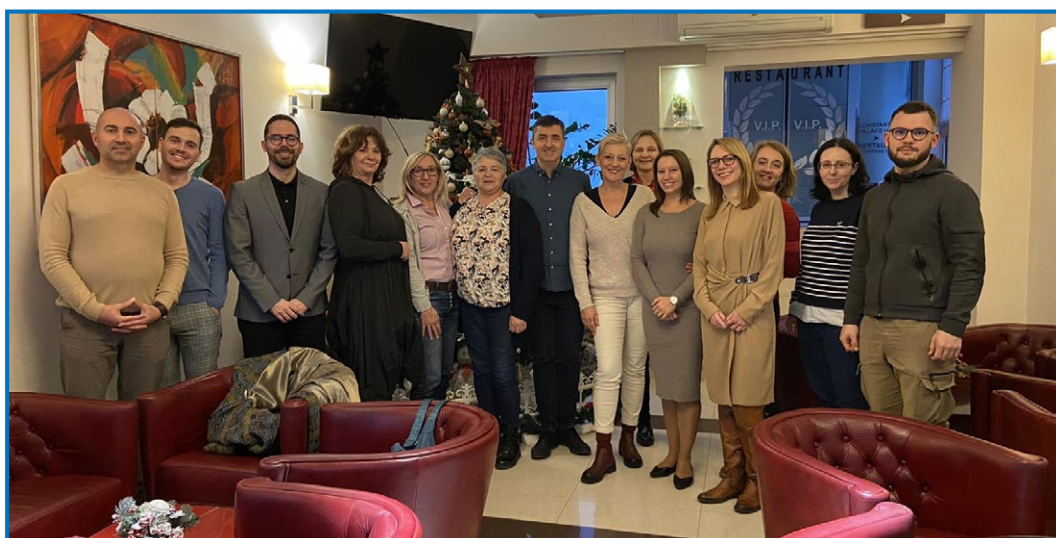
Panel discussion on participation of civil society in security sector reform, Niš, December 2023

The Mission also supports numerous other activities of civil society organizations aimed at combating gender-based violence. For instance, in co-operation with the Association for Development of Creativity from Aleksinac, the Mission organized workshops to empower civil society and rural women to fight this type of violence. In addition, it supported activities within the global campaign “16 Days of Activism against Gender-Based Violence”.