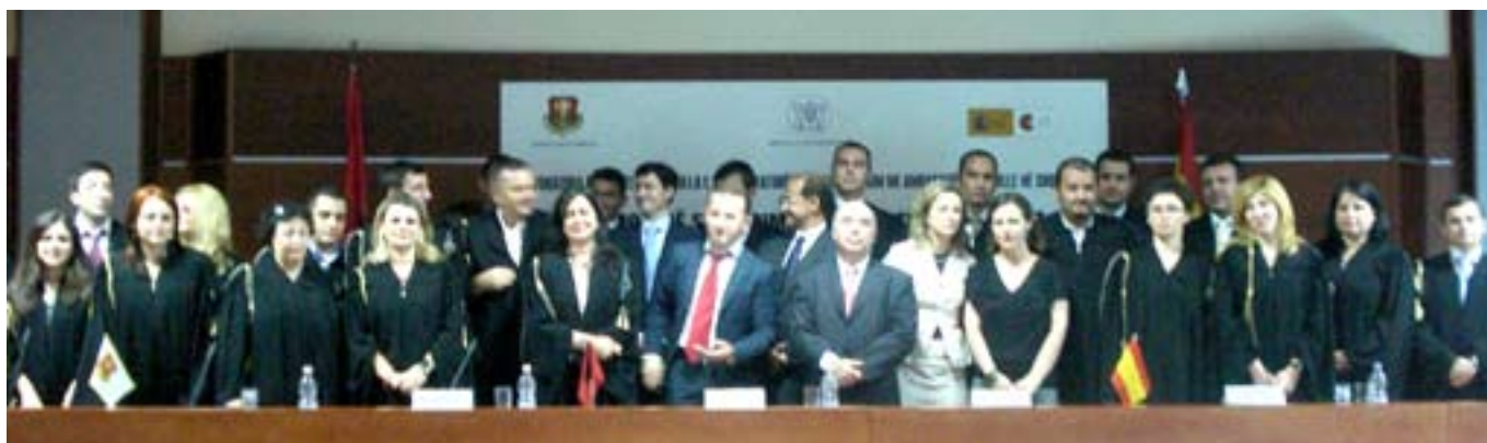
Photo: First promotion of Advocates of the State by competitive examination and training system

Many migrant workers transfer part of their income to relatives in their home countries. The Swiss Government, through its State Secretariat for Economic Affairs (SECO), issued a brochure on the various money transfer options and their costs. This aims to increase transparency in the money transfer market and the development impact of remittances. The brochure entitled International money