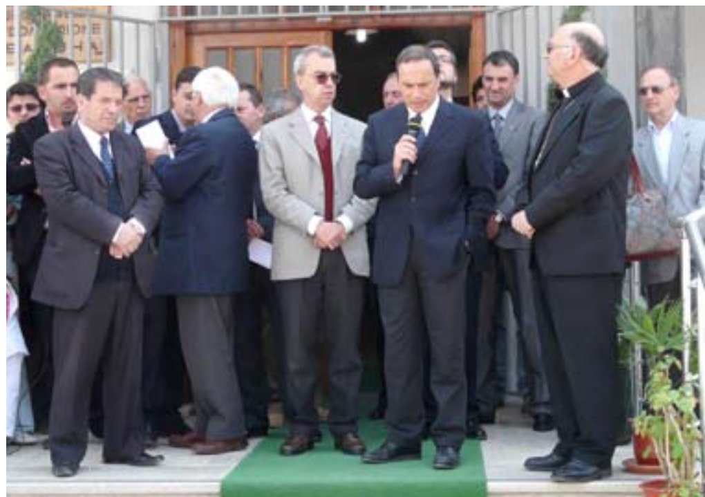
Photo: Inauguration of the Bardaj Bleran vocational centre in Shkodra

Euros, the Project aims at creating micro-enterprises and the development of a marketing strategy for distribution and production of honey. The two other projects related to Occupational Promotion and Re-qualification for the reinsertion of Migrant workers, implemented by the NGOs aritas and IPSIA and financed through 1 million Euros, and the joint initiative Vides/Labor Mundi Social and Cultural promotion of young people in Lezhe, financed through a 500,000 Euros grant. In Shkodra, the delegation inaugurated the Vocational Centre Bardaj Bleran. With a budget of 900,000 Euros, and implemented by the NGO Celim, the project supports the training of people