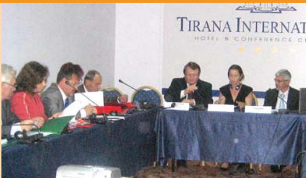
Photo: Environment SWG on Management of Municipal Waste held on 12 May 2009