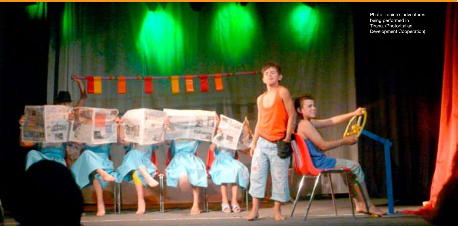
Photo: Tonino's adventures being performed in Tirana.