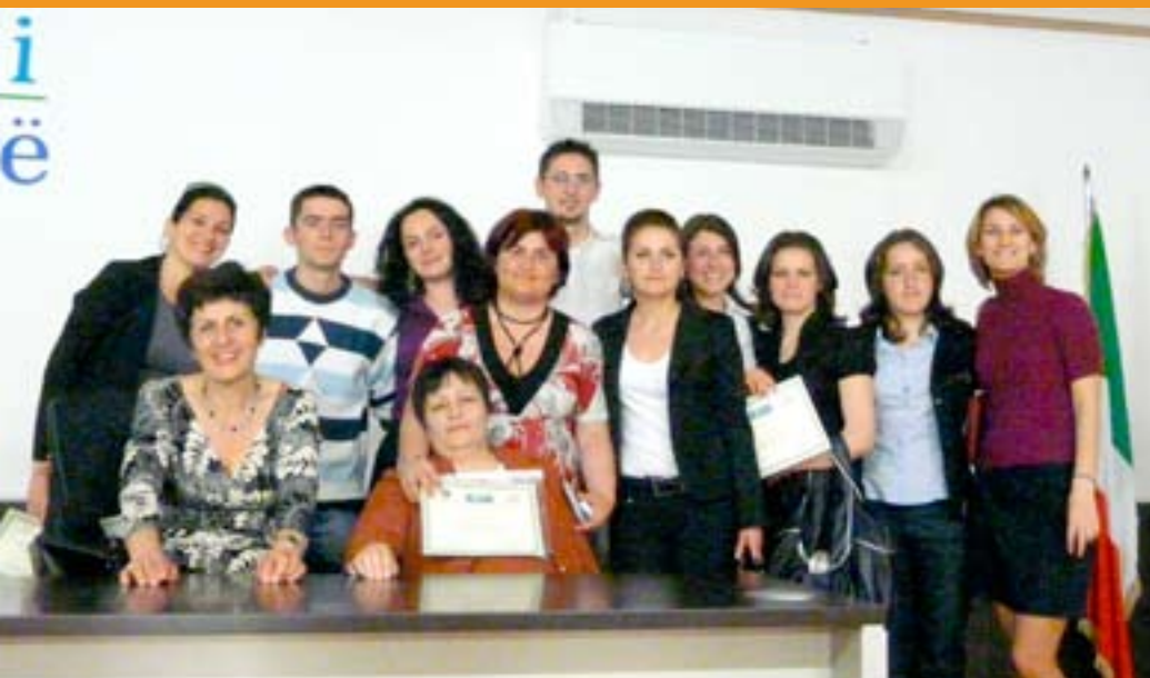
Photo: The Italian NGO Avsi issued diplomas to 70 students on vocational training courses for teachers and trainers