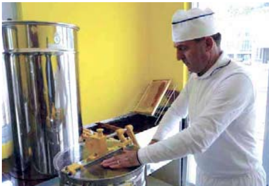
Photo: Ucodep project of beekeeping first honey production of the year