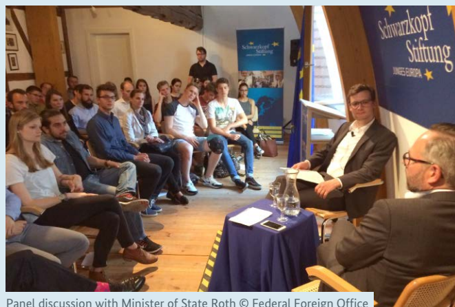
Panel discussion with Minister of State Roth

Paul Steiner from Germany: “The OSCE has a great impact on the consolidation of democratic reforms and the strengthening of civil society through its work on the ground. It is imperative to let youth lead the way when defining what their future society looks like.”