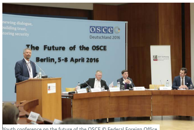
Youth conference on the future of the OSCE