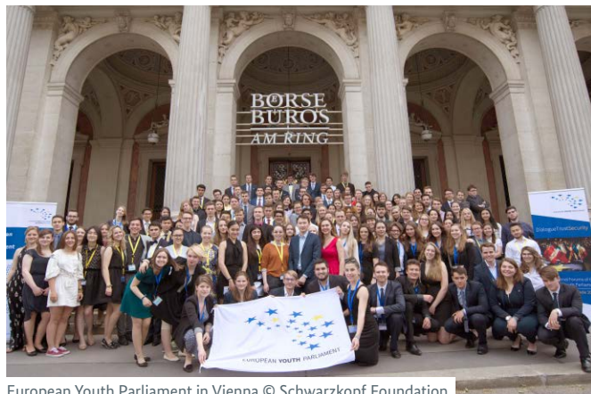
European Youth Parliament in Vienna © Schwarzkopf Foundation