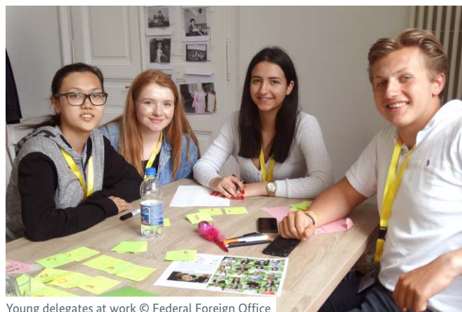
Young delegates at work