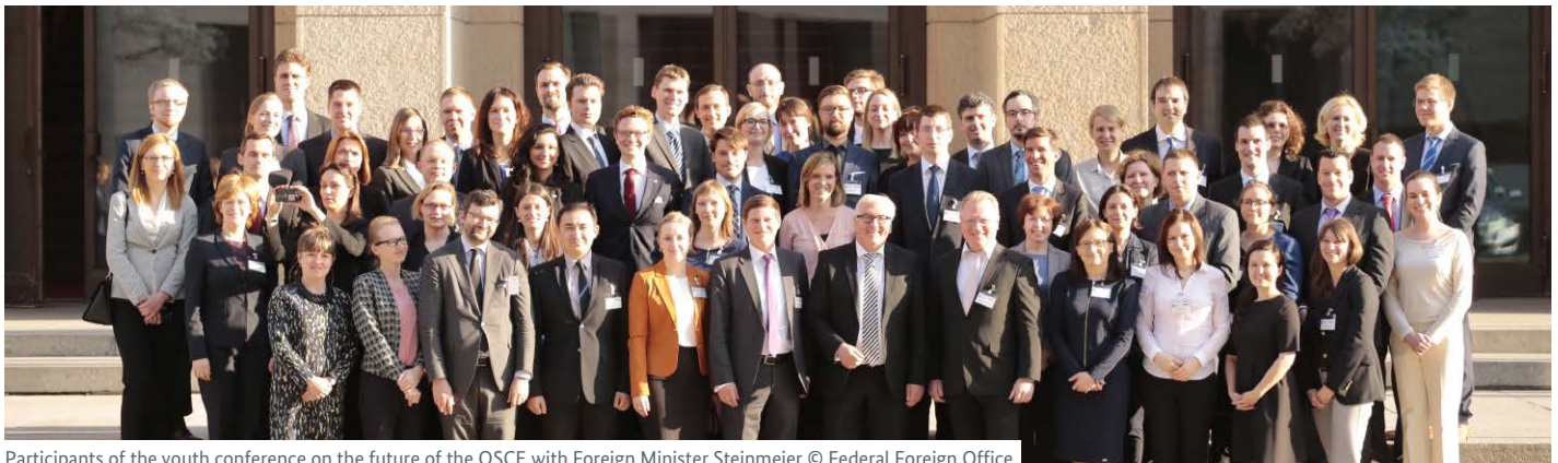
Participants of the youth conference on the future of the OSCE with Foreign Minister Steinmeier