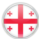
Example 4 Indicators and means of verification from Georgian NAP

Compiling this information, either during the lifespan of the NAP or upon its completion, generates the information necessary to then evaluate the NAP against its objectives, and assess its work against current programmatic needs across the areas of protection, prevention, prosecution and partnership. Such an evaluation should be rigorous and include suggestions for how to improve areas that fell short of their objectives. Example 5 from the evaluation of Switzerland's 2017-2020 NAP, demonstrates what this could look like, incorporating an overview of what the activity entailed within the NAP as well as an evaluation of its impact on counter-trafficking efforts.