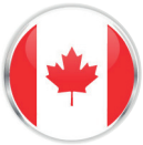
Example 9 Canada THB Strategy (Note: the Strategy is a broader policy document than a NAP)

For example, within the European Union, public procurement represents 14% of the region's Gross Domestic Product, 16 amounting to roughly two trillion Euros. 17 Leveraging this economic force to combat labour exploitation can dramatically decrease the market for goods and serves extracted from trafficked persons, and the profits made off that exploitation. Example 9 from the Canadian National Strategy to Combat Human Trafficking demonstrates what this could look like in practice, by directing resources towards the formulation of human rights and labour rights requirements for government suppliers, and engaging with the private sector on addressing issues of forced labour. Such activities effectively leverage the capacity of NAPs to generate political will, while also employing the economic power of the State to combat trafficking.