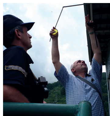
Field operations like the OSCE Mission to Skopje train law enforcement officers and work to enhance their technical means to prevent the illicit trafficking of weapons.