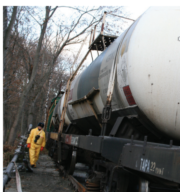
The OSCE has supported States such as Ukraine in safely removing hundreds of tonnes of toxic rocket propellant components from their territories.

The OSCE practical assistance projects are managed, coordinated, implemented and evaluated by the FSC Support Section, and conducted on the ground mostly through the OSCE field operations. The OSCE annually implements between 10-20 SALW and SCA projects in a number of participating States.