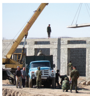
A new storage building was built in Tajikistan as part of the OSCE's support to the country in helping it to properly secure surplus stockpiles of ammunition.