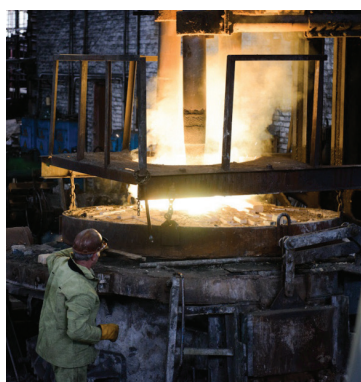
Surplus, obsolete and confiscated small arms and light weapons were melted down and destroyed in Moldova as part of an OSCE project.