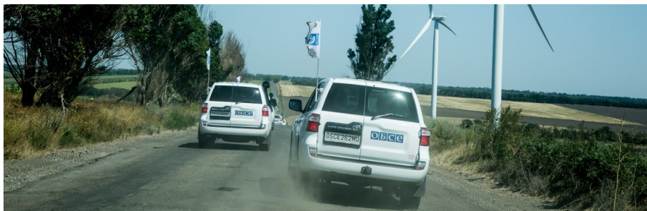
SMM patrol on the road in Donetsk region