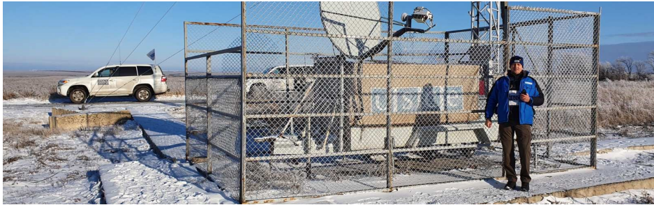
SMM patrolling near Bogdanivka, Donetsk region