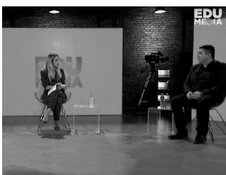
Still from an episode of EduMedia , a series of TV programmes on media literacy produced by the OSCE Mission in Kosovo.