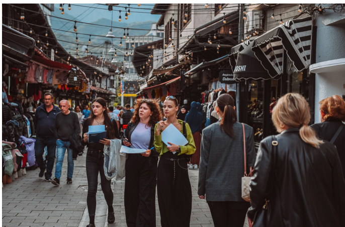
The Mission organized a camp for students of architecture and anthropology to expand their knowledge and awareness of cultural heritage values, along with its cultural, social and economic benefits. Students conducted research and documentation on the state of the Old Bazaar in Pejë/Peć.

The Mission works closely with other OSCE field missions in South-East Europe, to improve regional co-operation, dialogue and reconciliation.